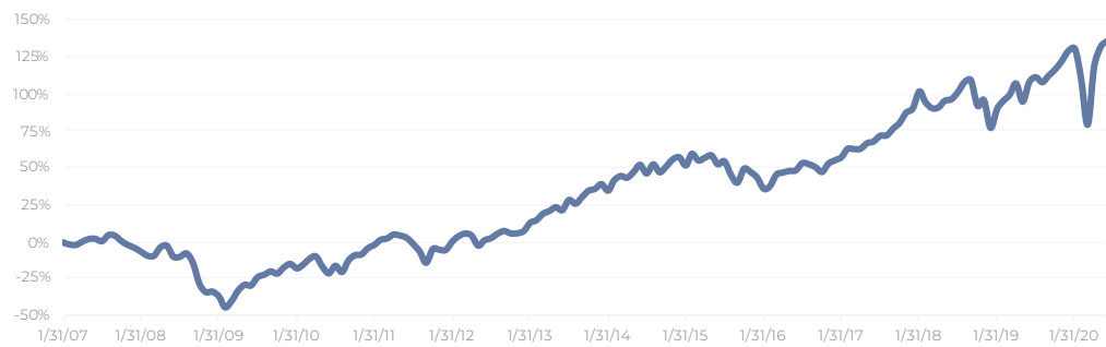
■ Dana Epiphany ESG Equity Fund Institutional