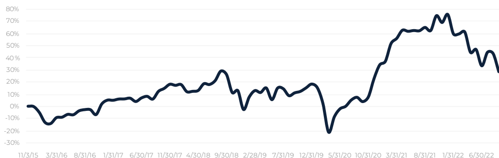
■ Dana Epiphany ESG Small Cap Equity Fund