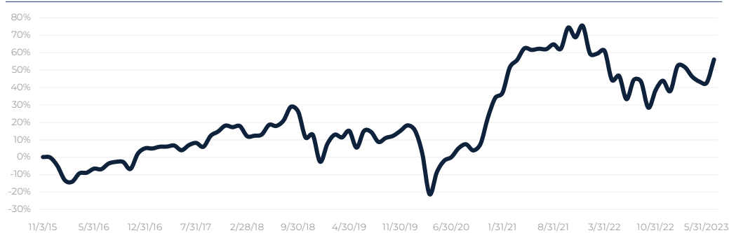
■ Dana Epiphany ESG Small Cap Equity Fund