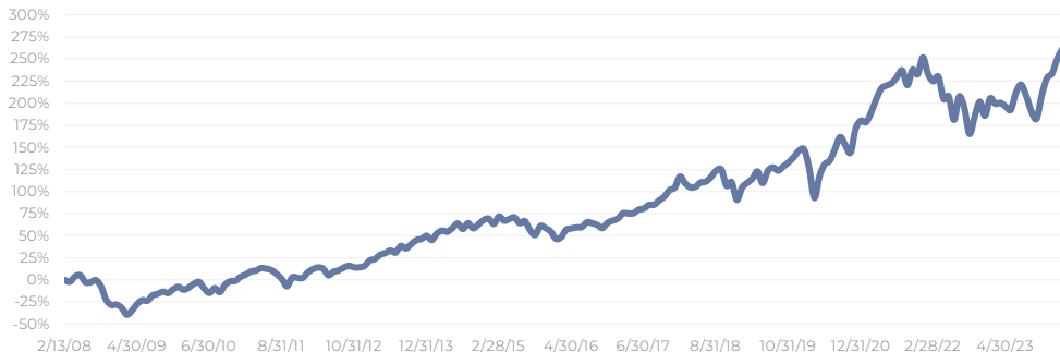
■ Dana Epiphany Equity Fund Institutional