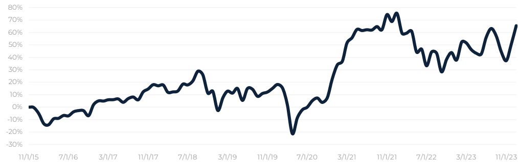
Dana Epiphany ESG Small Cap Equity Fund

The performance of the Fund quoted is past performance and does not guarantee future results. The investment return and principal value of an investment in the Fund will fluctuate so that an investor's shares, when redeemed, may be worth more or less than original cost. Current performance of the Fund may be lower or higher than the performance quoted. Performance data as of the most recent month may be obtained by calling 1-855-280-9648.