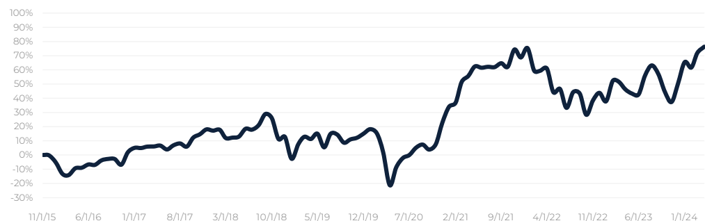
■ Dana Epiphany Small Cap Equity Fund