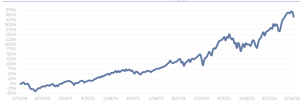
■ Dana Epiphany Equity Fund Institutional