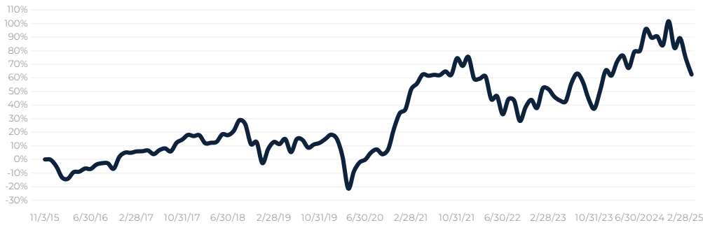
Dana Epiphany Small Cap Equity Fund

*The Dana Epiphany Small Cap Equity Fund has changed its primary benchmark from the Morningstar US Small Core Index to the S&P 500 Index. As part of the new Tailored Shareholder Report requirements, the SEC has narrowed the definition of a Broad-Based Securities Market Index. The primary benchmark must represent the overall applicable domestic market and cannot represent a sub-set of the market such as small cap.